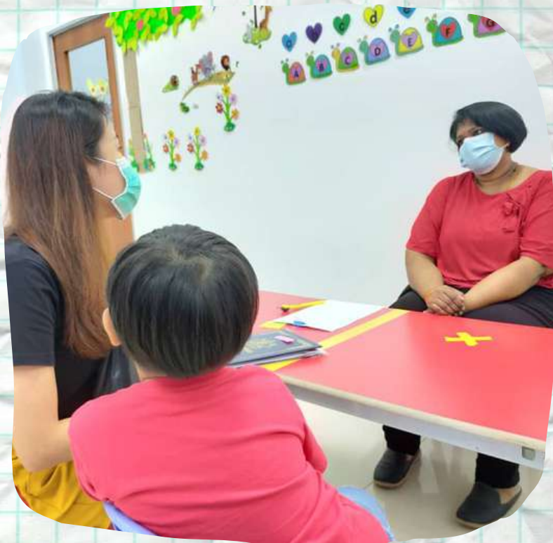
(Miss Umma consulting with a parent)