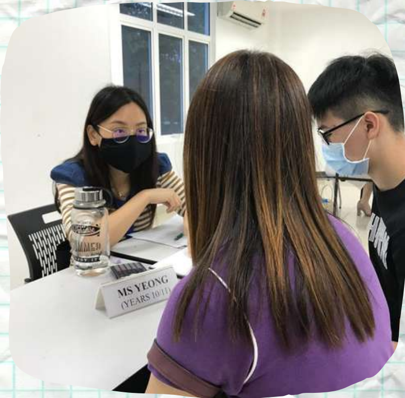
(Miss Yeong consulting with a parent)