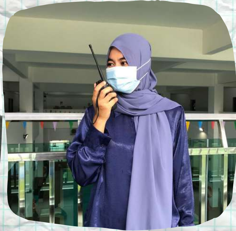
(Miss Intan stationed at the corridor to escort parents and students)