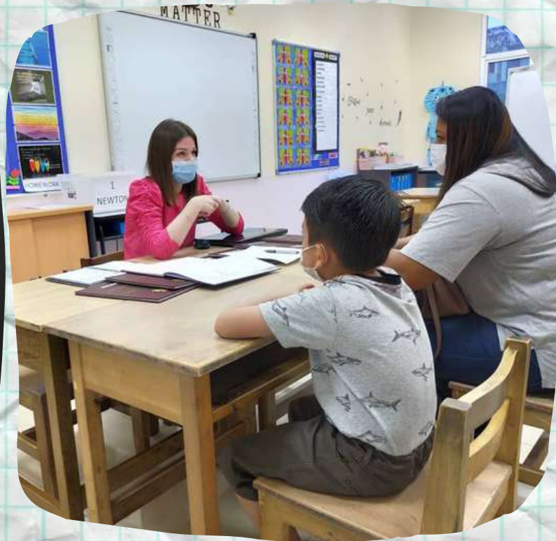
(Miss Tetiana consulting with a parent)