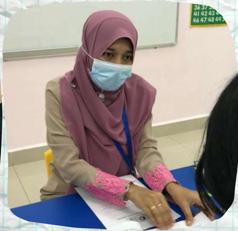
(Miss Hazlina consulting with a parent)