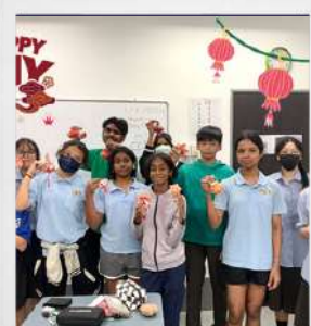
TINKER TRIBE CLUB ACTIVITY