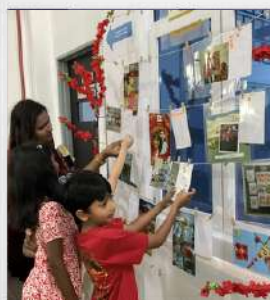
CNY PHOTOGRAPHY CONTEST