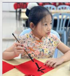
CNY CALLIGRAPHY COMPETITION