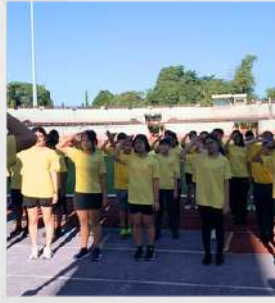
SPORTS DAY REHEARSAL