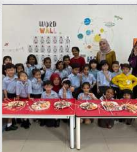
CNY YEE-SANG BY PRESCHOOL