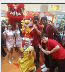
CNY CELEBRATION AT AEON MALL