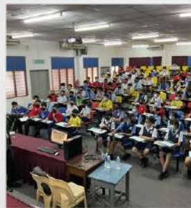
MOTIVATIONAL TALK BY ZIS