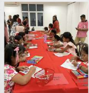
CNY COLOURING COMPETITION