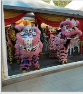
LION DANCE AT ZIS