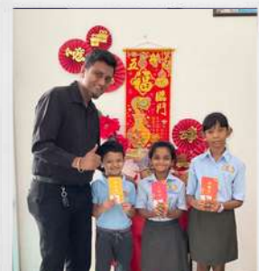
CNY LIBRARY CHALLENGE