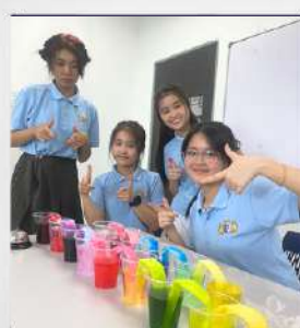
CHEMISTRY CLUB ACTIVITY