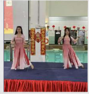
STUDENT PERFORMANCE FOR CNY