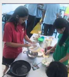
CULINARY ARTS CLUB ACTIVITY