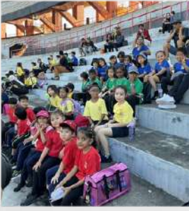
SPORTS DAY HEAT