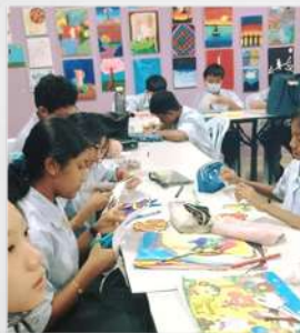
ART & CRAFT FOR CHINESE NEW YEAR