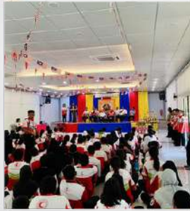
ZIS SPONSORS RED CRESCENT SOCIETY